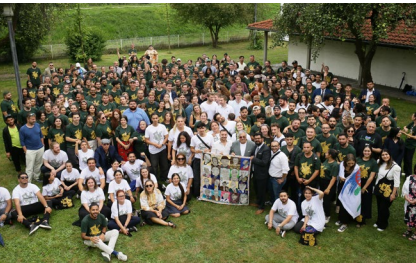
Dikh He Na Sister, Look and Don't Forget, 2014, Birkenau Camp Visit

The Holocaust did not begin with the camps. It began with words, ideologies, and laws. Across Europe in the early 20th century, fascist movements promoted exclusionary nationalism, racial pseudoscience, antisemitism, and anti-Roma propaganda.