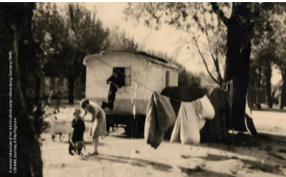
A woman takes care of her child in a Roma camp in Würzburg, Germany (1945).

Bravery does not require guns. Sometimes, the biggest acts of courage happen quietly.