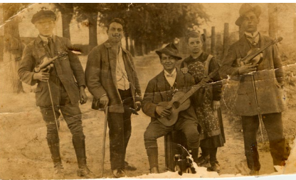
Members of a French-Hungarian Romani musical band pose for a photograph with their instruments; 1920 - 1930, Lyon, [Rhône] France?