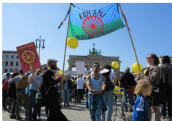
8 April, International Roma Day parade, Berlin, 2018, Photo © Nihad Nino Pullja

The memory of May 16 and August 2, 1944 reminds us that even in the face of overwhelming violence, the assertion of dignity and humanity becomes an act of resistance. It stands as a powerful testament to the perseverance and courage of Roma communities, past and present.