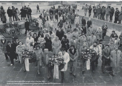
Commemorative rally of the hunger strike in Dachau, 1980.

After World War II, the suffering of Roma communities was largely excluded from public memory. No Roma testimonies were included in the Nuremberg Trials, and Roma survivors were denied recognition and compensation for decades. The formal recognition of the Roma Holocaust came very late: only in 1982 did Germany officially acknowledge the Nazi persecution of Roma and Sinti as genocide on racial grounds.