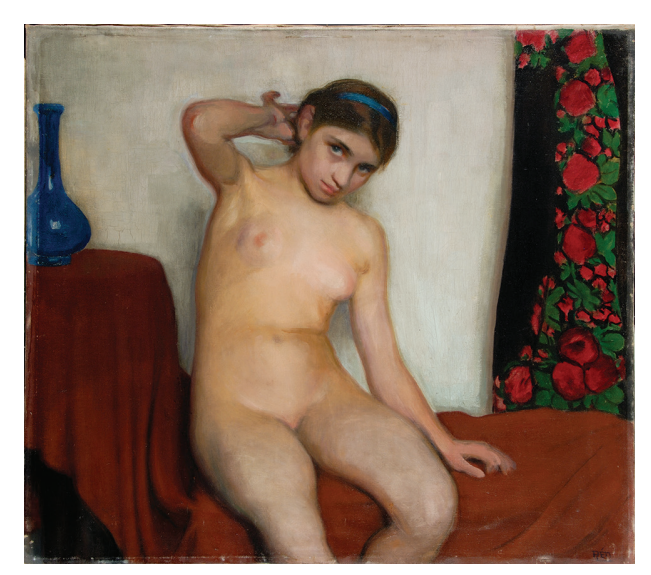
Figure 7. István Réti, Gypsy Girl , 1912, oil on canvas, 80.5 x 91 cm, Hungarian National Gallery, Budapest.

A half-grown girl looks at us with timid, inquisitive eyes from István Réti's nudes of 1912/13; she is probably younger than any model of her kind in the history of modern art (Figure 7). These paintings by a renowned master of the famous Nagybánya art colony and a significant artist of twentieth century Hungarian painting are considered masterpieces by Hungarian art historians. However, almost a century later, it is the plight of the vulnerable child, rather than the artistic performance, that strikes the eye. Thus, it is incomprehensible why one should discover the 'joy and beauty of youth' in them (Szöllőssy 2002, 78). Indeed, the longer we linger on this girl's figure the more we see Nabokov's Lolita