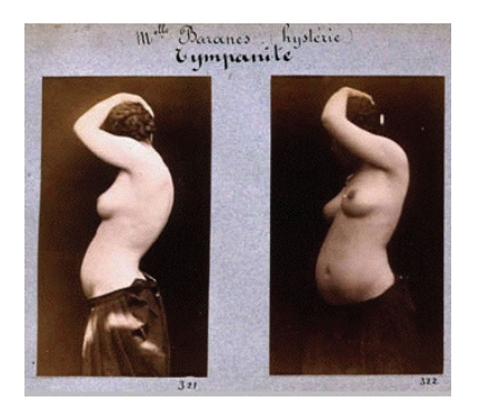
Figure 2. Albert Londe, Mlle Banares (hystérie); Tympanite, c. 1883, toned gelatine silver, 35.5 x 47 cm.

presented to the public, including some of the most distinguished medical doctors, scholars, politicians, and artists of the age, in a so-called amphitheatre – just like the recording of these events in the photographic series – reflected a kind of mediatised image of sick female sexuality , calling for the disciplinary and controlling power of the men's world. 'If everything seems to be in these images, it is because photography was in the ideal position to crystallize the link between the fantasy of hysteria and the fantasy of knowledge' (Didi-Huberman 2003, xi).<sup>[10]</sup> Such positioning of the female body, detached from space and time and deprived of identity was perfectly apt to condense the various images of women, the 'other', and those with unstable moral identities (prostitute or criminal) in a single image, in which the nude does not look back anymore but deflects herself from her own body.<sup>[11]</sup>