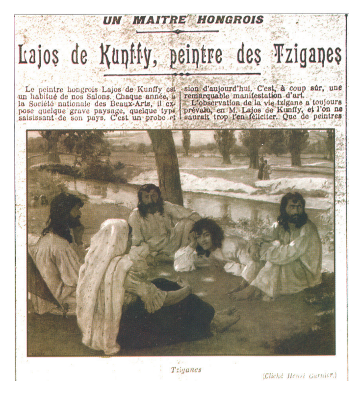
Figure 6. Tabarant, 'Un maître Hongrois. Lajos de Kunffy, peintre des Tziganes'. Paris Midi , 29 January 1913.

(...) They would come to me after the war, too, asking if I still wanted to paint them, without their long hair, as they liked the easy money. Lately, realising it was more comfortable this way, even children have ceased to wear long hair. Therefore, I stopped being that interested in men ; I painted, instead, a couple of beautiful girls and the so-called Kolompár Gypsies whose outfit is a lot more colourful (Kunffy 2006, 108–109 – translated by Róza Vajda, author's italics).