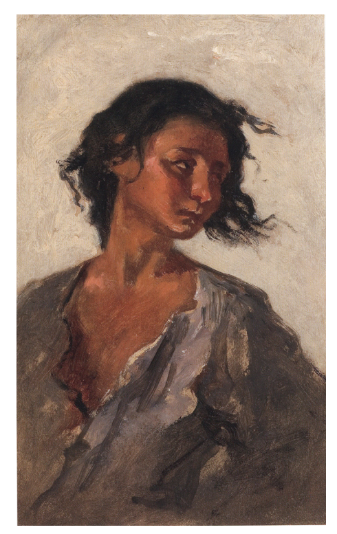
Figure 4. August von Pettenkofen, Brustbild eines Zigeuners , c.1860, oil on wood, 23 x 19 cm, Österreichische Galerie Belvedere, Wien.