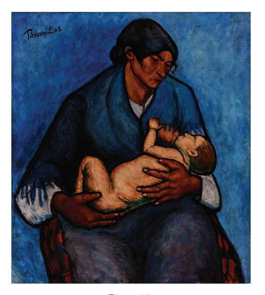
Figure 10. Lajos Tihanyi, Gypsy Woman with Child , 1908, oil on canvas, 84 \times 75 cm, Janus Pannonius Museum, Pécs.