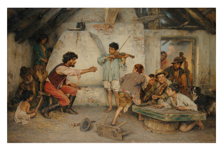
Figure 12. János Valentiny, Gypsy School , 1896, oil on canvas, 129 x 197 cm, Hungarian National Gallery, Budapest.

trope for the noble, the bourgeois, or the folkloric, nor were 'Gypsy' figures conferred a 'savage' look so as to confer an exotic appearance. Instead, Valentiny made loveable genre paintings, and in many of which he situated himself as an observer among Romani neighbours. Though an ahistorical exaggeration, I venture to say he drew the non-Gypsy world into that of Romani people as part of a proactive mission (Figure 12).