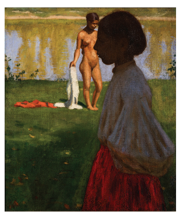
Figure 1. János Göröncsér Gundel, Gypsy Girl and Nude Model , c. 1907, oil on canvas, 69 x 59 cm, Hungarian National Gallery, Budapest.

This essay reflects the position of a sociologist interested in visual studies. My knowledge lies in the representation of Otherness from studies of Central European Jewry from the nineteenth to twentieth centuries. It was in the early 1990s that I read The Jew's Body (Gilman 1991). In this book, Sander L. Gilman analysed anti-Semitic rhetoric with the help of case studies on Jewish body and mind, creatively combining medical and historical approaches. I was impressed deeply by this book, so I read Gilman's other writings, including Black Bodies, White Bodies: Toward an Iconography of Female Sexuality in Late Nineteenth-century Art, Medicine, and Literature (1985), the line of argument of which I attempt to follow in this essay. I also became familiar with two important books by Georges-Didi Huberman: Invention of Hysteria (2004) and Opening up Venus (1999). As far as I know, these two favourite authors of mine never referred to each other's works; nevertheless, I connected