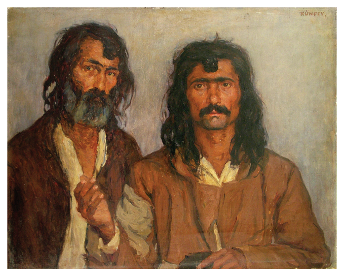
\label{eq:Figure 9.} Lajos Kunffy, Two Gypsies , 1910, oil on canvas, 73 × 92 cm, Kunffy Museum, Somogytúr.