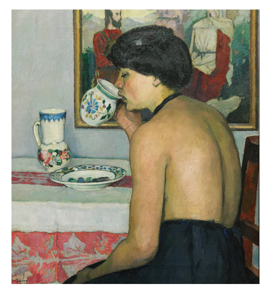
Figure 11. Pál Jávor, Gypsy Girl , c. 1915, oil on canvas, 80 \times 71 cm, Damjanich János Museum, Szolnok.